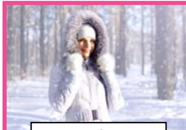
Seasons in Japan