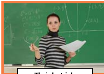
Their last job