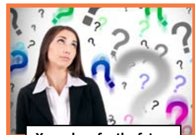
Your plans for the future