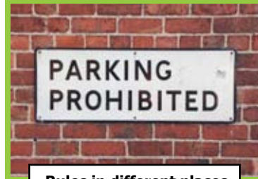
Rules in different places