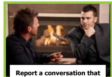
Report a conversation that you have heard recently