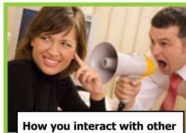
How you interact with other people (causation)