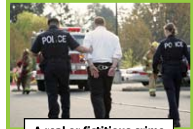
A real or fictitious crime