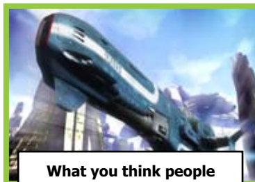
What you think people will be doing in the future