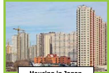
Housing in Japan