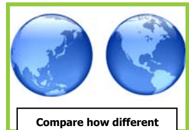
Compare how different two places or people are